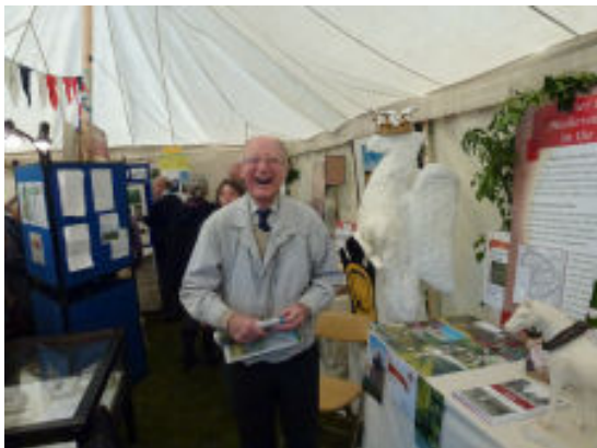
Our Jubilee tent in Salisbury

For the Queen's visit to Salisbury in May, the Area Board co-ordinated a display tent for the 38 parishes that form the Mere, Tisbury and Wilton community areas. This included a joint display with the AONB, live story-telling, young people engaged with the leisure credits scheme, bell-ringing by a local school and many exhibits from contributing parish councils.