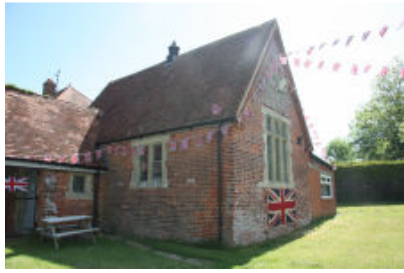
West Knoyle Village Hall

loops, improving energy efficiency. There are now more high quality and available spaces for local events and activities.